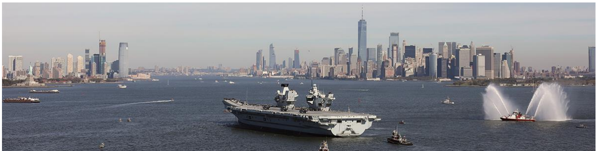
HMS QUEEN ELIZABETH visits the Big Apple.