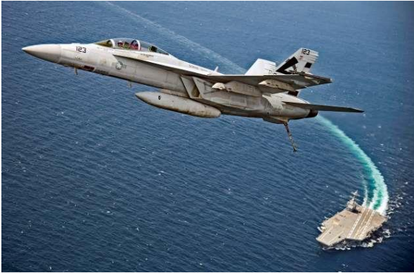
An F/A-18F Super Hornet jet flies over the USS Gerald R. Ford